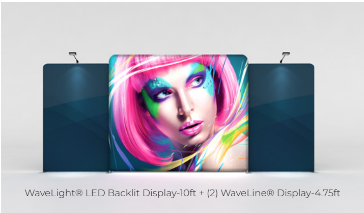
WaveLight® LED Backlit Display-10ft + (2) WaveLine® Display-4.75ft