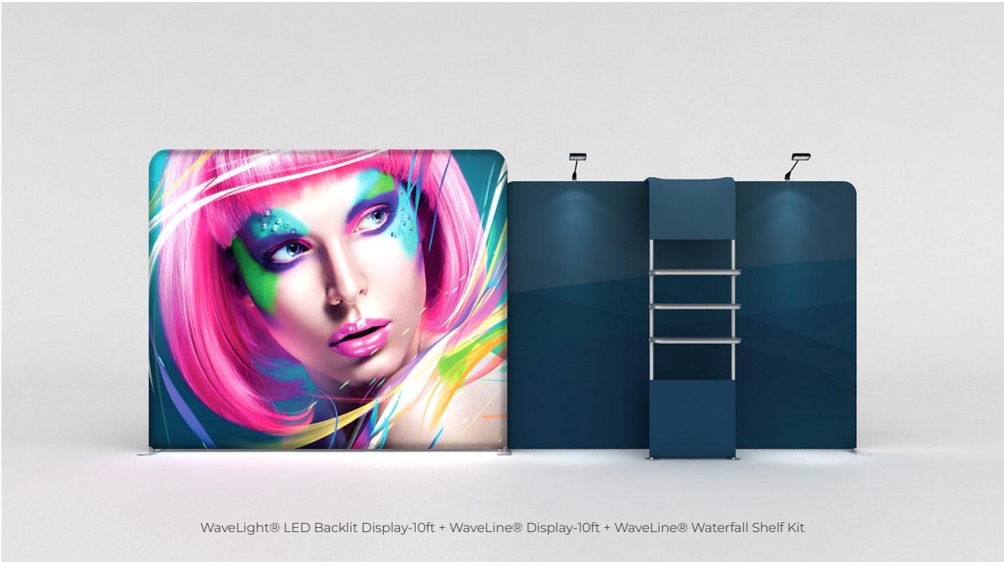
WaveLight® LED Backlit Display-10ft + WaveLine® Display-10ft + WaveLine® Waterfall Shelf Kit