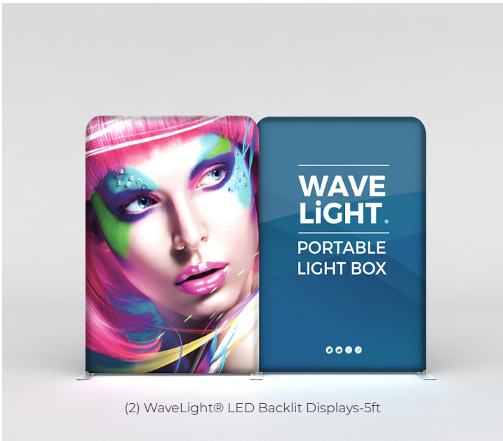
(2) WaveLight® LED Backlit Displays-5ft

The WaveLight® Display product line is an extremely versatile collection. We take pride in providing our customers with endless display solutions. WaveLine® Media products are a great option to add your own custom environment with monitors, brochure holders, counters and many more creative solutions.